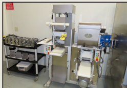
ARCOBALENA AMF160 Multi-Function Pasta Machine-Automatic Mixer, Sheeter, Pasta Cutter Ravioli Machine with Molds

PASTIFICIO 601-PASTA & RAVIOLI MAKING MACHINERY, COOKING APPLIANCES, BLAST FREEZER, WALK-IN BOXES, REFRIGERATION, CURVED GLASS CASES, PAPER SUPPLIES, SMALL WARES & MORE