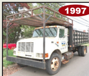
INTERNATIONAL 4700 Stake Body Dump Truck

Sale Opens Thursday, August 15th, Closes Tuesday, August 20th- Removal August 21st thru 23rd