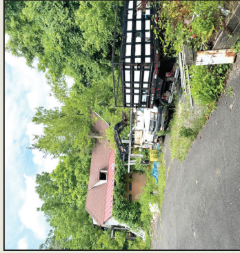
View of the Detached Garage and Back Yard Parking

TERMS: Buyer must present $25,000 Certified Check to register to bid. An 8% Buyers' Premium will be charged, once the bid has been confirmed; payable at settlement. Settlement in 45 days or less