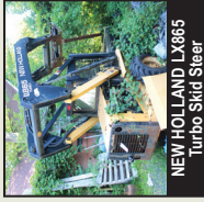
NEW HOLLAND LX865 Turbo Skid Steer