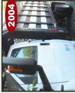
CHEVY C4500 Stake Body Truck